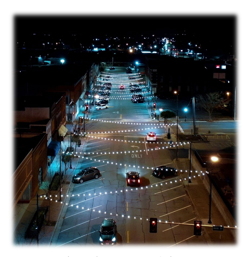
9th Street's Downtown Festival Area