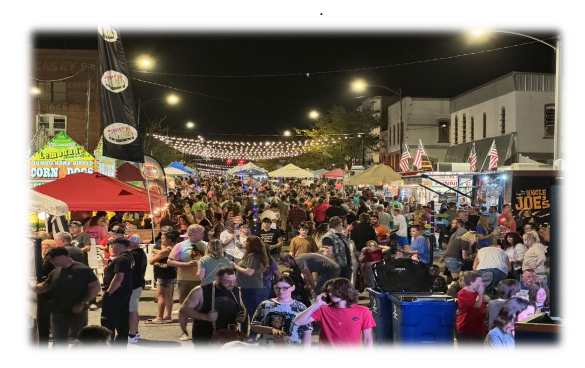
Fall Fest is Mt. Vernon's largest festival. It is held downtown each year in late September/early October

P.O. Box 1708 618-242-3151 tourism@mtvernon.com