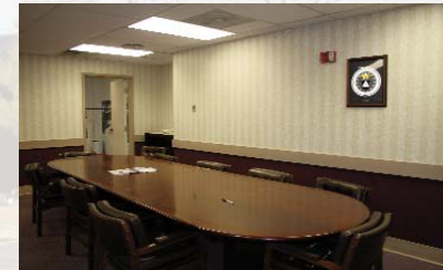
Office Suite 131